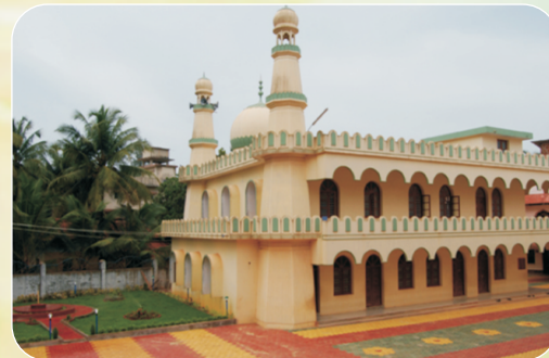
Masjid Al Ansar Inaugurated 03/07/2003