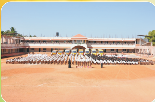
Academy School Inaugurated 16/06/2005