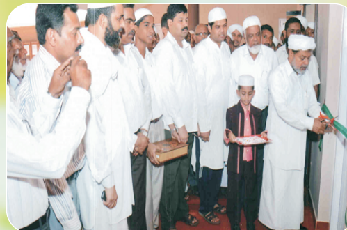
Inauguration of prayer Hall at Academy School