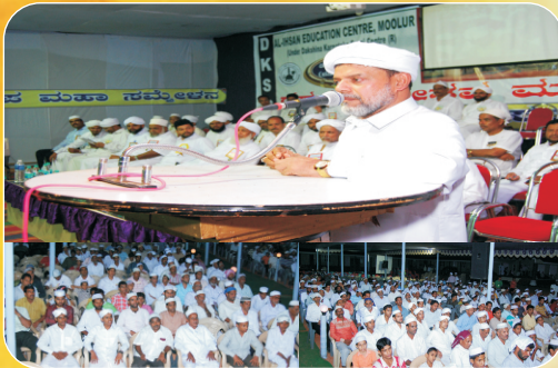
President Addressing in Decennial Function