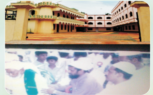
Markaz Inauguration 15/05/1999