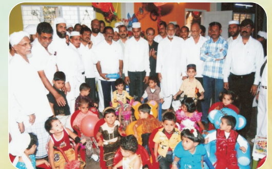
Inauguration Play school 02/01/2009