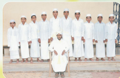
Al Ihsan Hifzul Qura'an Students