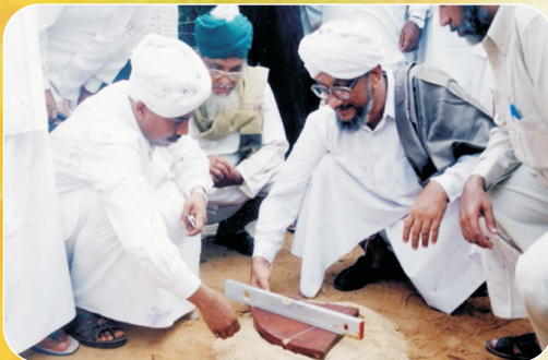
Foundation to Masjid Al Ansar 15/11/2001