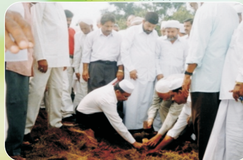
Foundation stone to Academy School on 23.10.2003