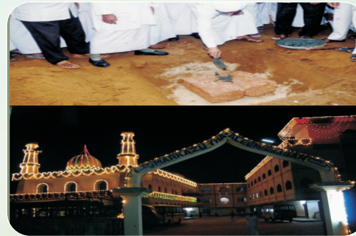
Al Ihsan main Campus Building Foundation 3/8/1987