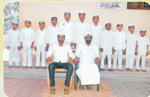
Destitute Students (Miskeen)