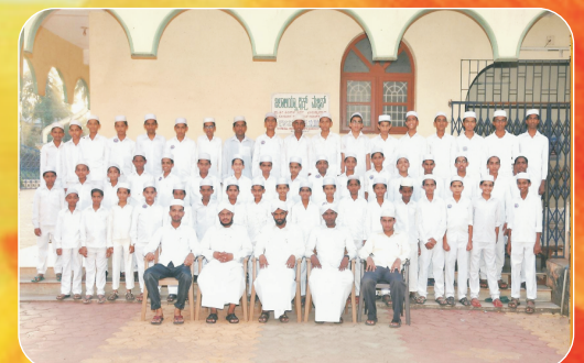
Residential School Students