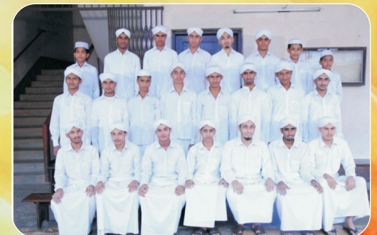
Al Ihsan Arabic College Students